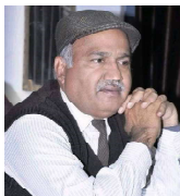
By: Vijay Garg

Books are giving important information along with spending time in lockdown