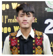
By: Thangminlun Haokip

I was dumb-struck on hearing the above quotation from a movie I had watched lately, "All The Bright Places" recommended to me by a friend the other day on Netflix which costs me an hour and a half and just a cup of coffee.